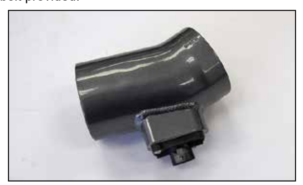
10. Remove the mas air sensor from the factory housing and install it into the AEM® intake tube using the hardware provided.