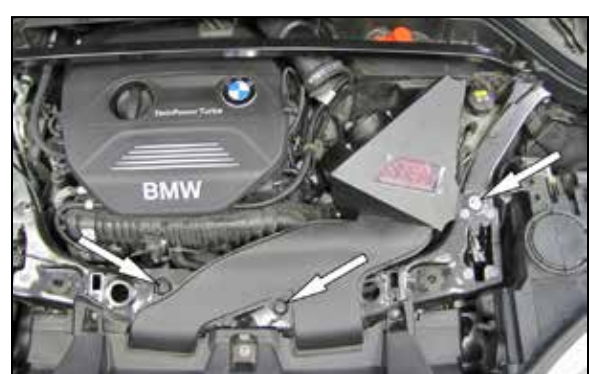
9. Install the air filter assembly into the vehicle and secure with the factory fresh air scoop nuts and the bolt provided.