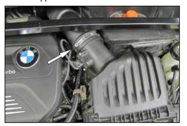
5. Loosen the hose clamp that secures the intake hose to the air filter housing then remove the air filter housing from the vehicle.