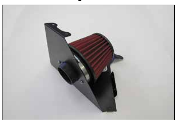
7. Install the provided filter adapter into the heat shield and secure with the provided hardware. Install the provided air filter onto the filter adapter and secure with the provided hose clamp.