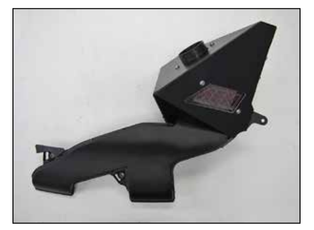
8. Install the AEM® badge into the upper air filter housing and then assemble the two filter housing halves and fresh air scoop and secure with the provided hardware.