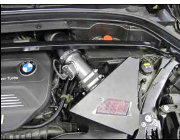
11. Install the provided coupler onto the intake tube but do not secure. Install the intake tube assembly into the factory intake hose and align with the filter adapter, slide the coupler onto the adapter and adjust the assembly for best fit. Secure the intake tube assembly with the provided hose clamps. Reconnect the mass air sensor electrical connection.