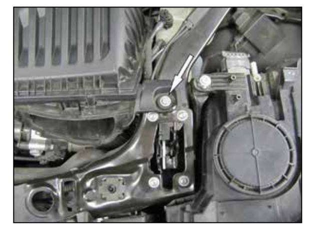
4. Remove the bolt that secures air filter housing to the core support.