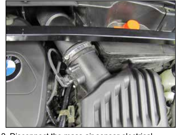
2. Disconnect the mass air sensor electrical connection and disconnect the wiring harness from the air filter housing.

NOTE: Disconnecting the negative battery cable erases pre-programmed electronic memories. Write down all memory settings before disconnecting the negative battery cable. Some radios will require an anti-theft code to be entered after the battery is reconnected. The anti-theft code is typically supplied with your owner's manual. In the event your vehicles anti-theft code cannot be recovered, contact an authorized dealership to obtain your vehicles anti-theft code.