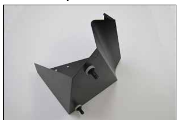
6. Install the provided mounting studs to the heat shield as shown.