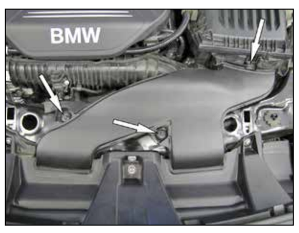
3. Remove the two bolts that secure the fresh air intake duct too the core support. Release the locking tab at the air filter housing and then remove the fresh air intake duct.